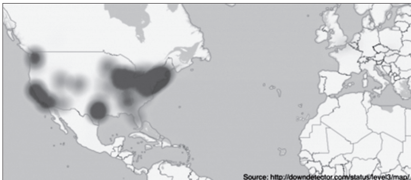
Fig. 1. Map of areas DDoS attack in October 2016 (Hamblen, 2016)

In order to execute this attack a malicious piece of software, a botnet called Mirai was used. Based upon information published by Imperva Incapsula (Zeifman et al., 2016), a security firm who analyses such attacks, the IP addresses of Mirai-infected devices were spotted in 164 countries worldwide (See Fig. 2). As further analyzed and described by Imperva Incapsula, the Mirai botnet was and still is specifically targeted to attack IoT devices to launch DDoS attacks from commands issued from a command and control server. This botnet was designed to find easy targets by performing an automated scan of Internet addresses to locate poorly secured devices that could be readily accessed using easy to find login credentials. The software was then able to break in and install itself on these devices by using a crude form of hacking, referred to as the brute force technique.